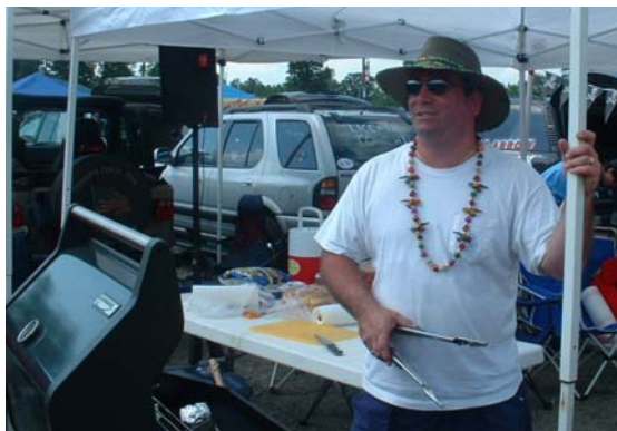
Grill Master Rock

Fueled by the music (and the margaritas) we headed back into the parking lot after the show, fired up the grills again and continued the party into the wee hours of the morning while we waited for the parking lot to clear.