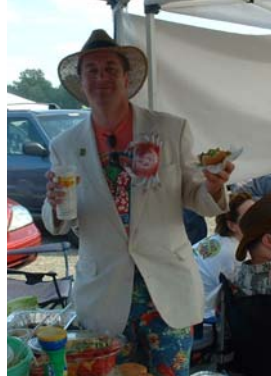
A White Sport Coat & a Pink Crustacean