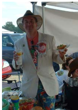
A White Sport Coat & a Pink Crustacean