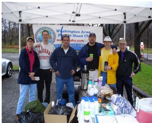
Nice and dry before the clean up

Over the month of April a record 186 tons of garbage were collected from