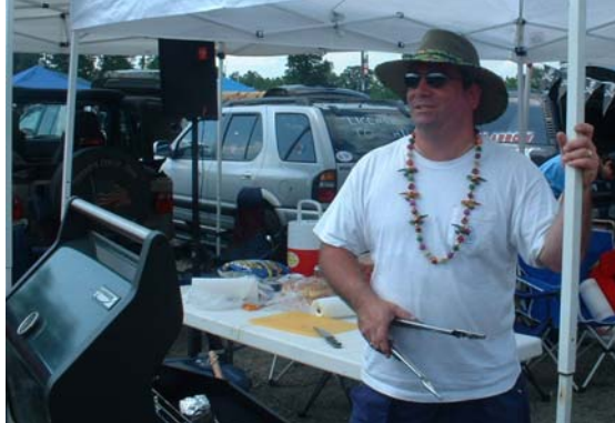
Grill Master Rock

Fueled by the music (and the margaritas) we headed back into the parking lot after the show, fired up the grills again and continued the party into the wee hours of the morning while we waited for the parking lot to clear.