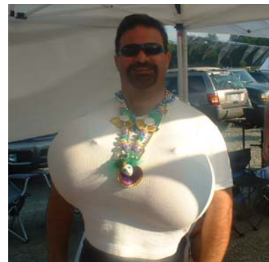
I dream of...Gene(ie)?