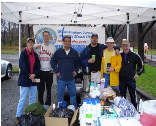
Nice and dry before the clean up

Over the month of April a record 186 tons of garbage were collected from