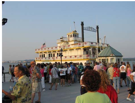
Waiting to board the Cherry Blossom