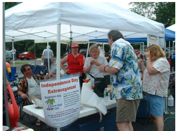
Parrot Head Chili Booth

This event raised $249 for the Alzheimer's Association, and while not the fundraising success we had hoped for, gives us a base to build on to make next year's event even better!