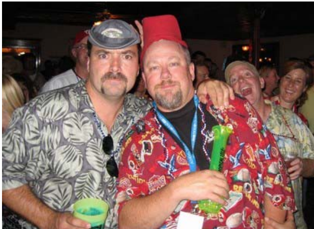
A picture is worth 1000 words.