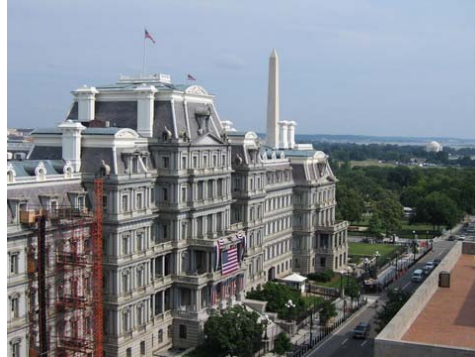
What a view! View from the rooftop party.

We'd like to thank again those that worked for months on the planning of the events, our many event day volunteers, the bands, the venues, and our many, many Parrot Head friends who helped make this event such a rousing success! We're soon to present the Chesapeake Bay Foundation with a $3500 donation from the event!.